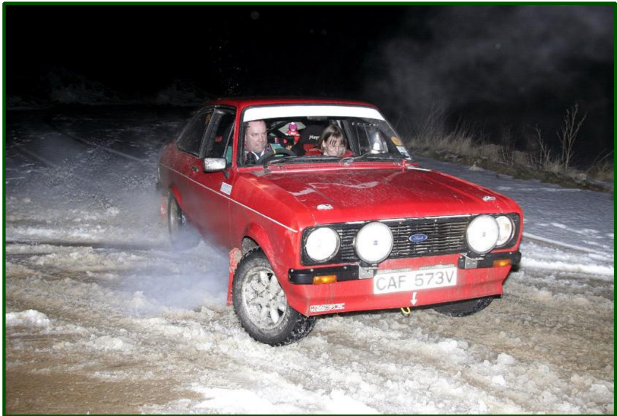
Martin Betts / Cath Woodman – The Bruce Robinson Rally winners 2009. Photo taken on private land